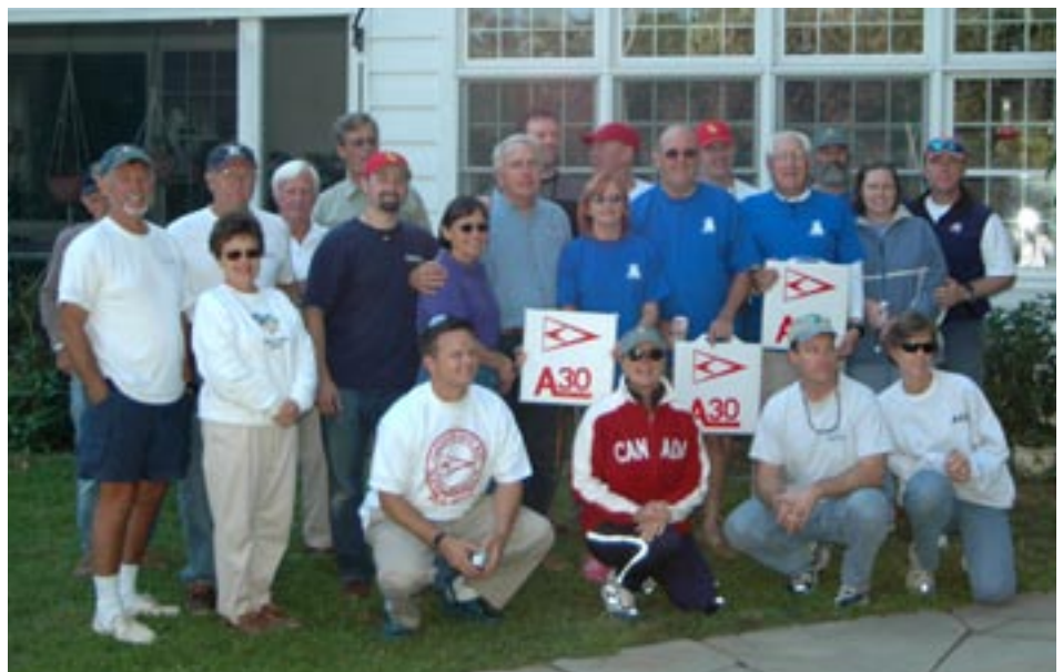
A happy group of Chesapeake Bay Alberg 30 Association and Great Lakes Alberg Association members pose for the camera at the conclusion of this years Friendship Challenge Series in Annapolis MD.