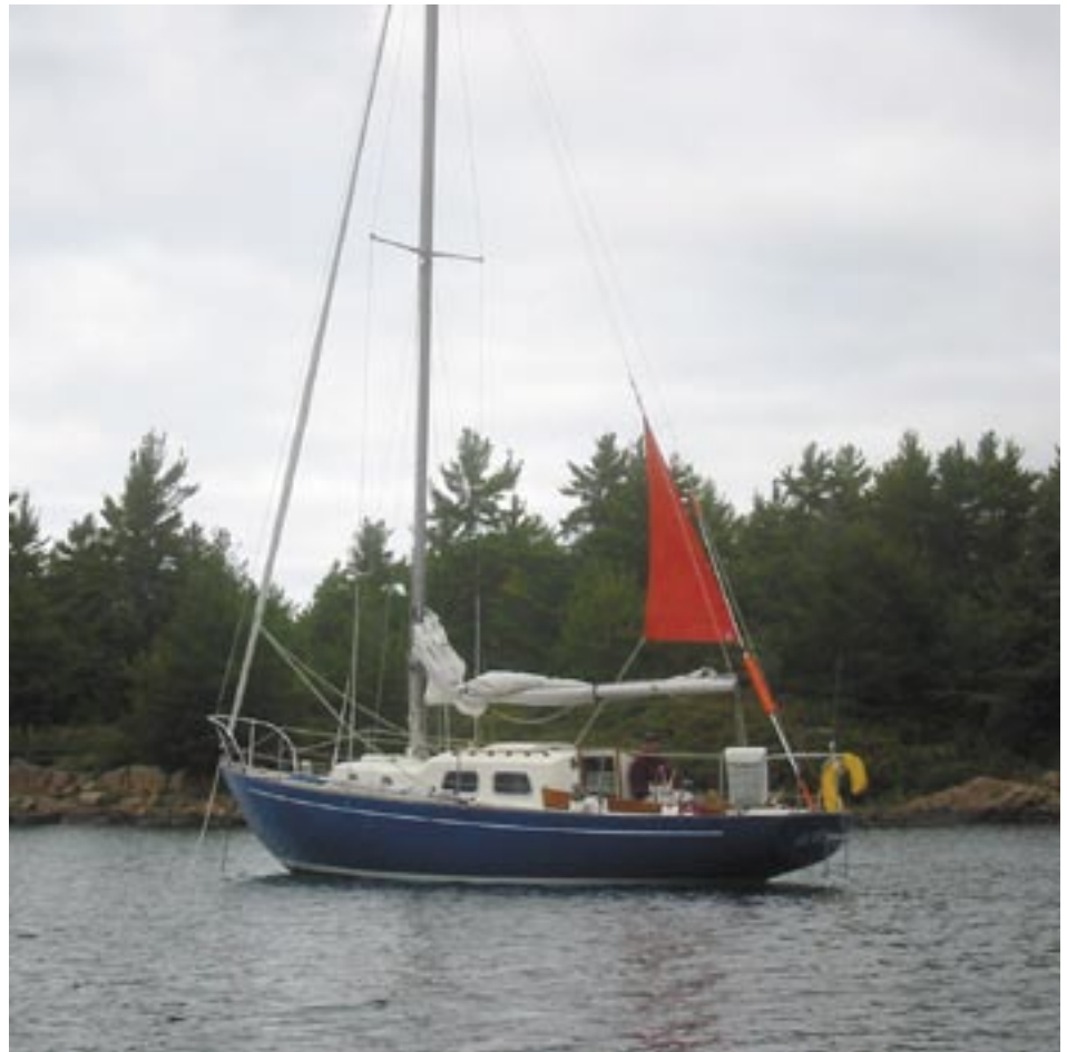
Surprise at anchor in Birdsong Bay – furthest north on Misery Cruise '06