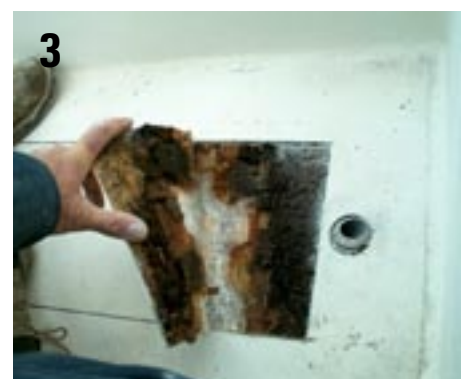
1. The moisture meter registered water saturation everywhere, so the entire cockpit sole would have to be opened up. 2. Using a diamond saw I cut the upper surface into strips for easy removal. 3. You can see how the water entered the core at the rudder post, progressing forward through the balsa core.